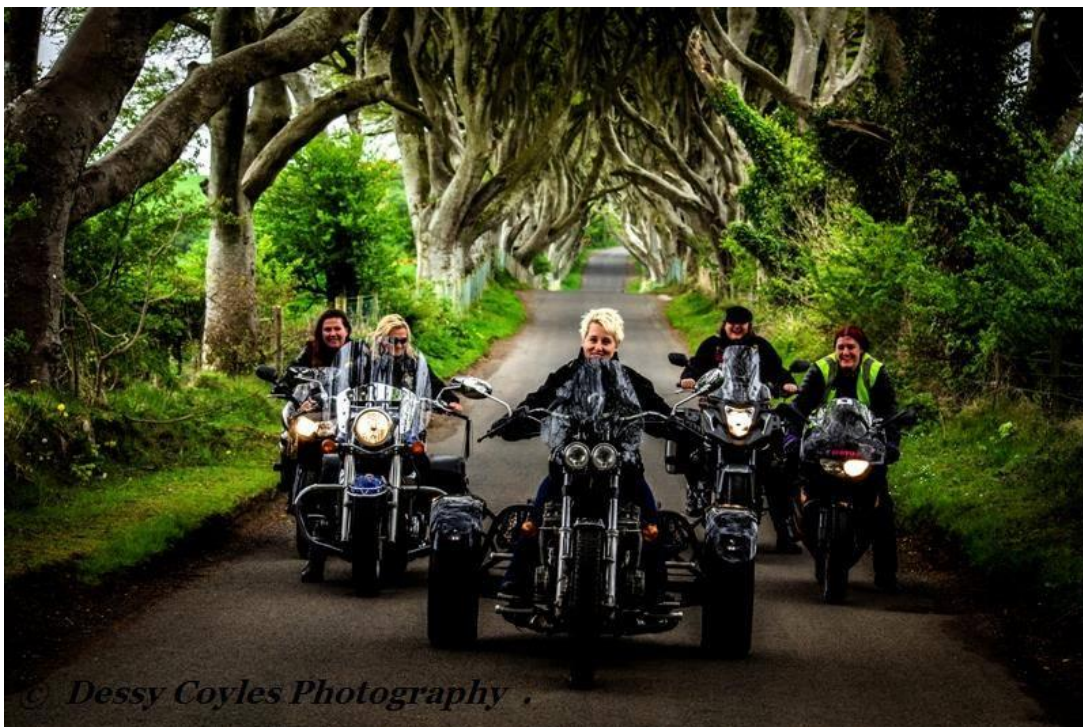
Figure 1: 2014 IFRD PHOTO CONTEST WINNER - IRELAND